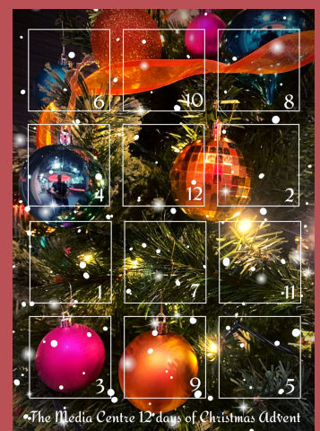
The Media Centre 12 days of Christmas Advent

To be in with a chance of opening a door and wining a treat, pop down to reception between the 28th November and the 7th December and add your name to our Nice List!